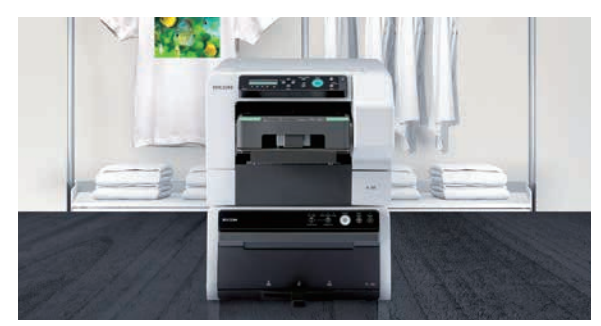
* RICOH Ri 100 printer with the RICOH Rh 100 finisher option.

The RICOH Ri 100 can fit into a space as small as 399 x 698 mm, making it one of the smallest DTG printers. The printer and its finisher can be stacked to maximize functionality without sacrificing space.